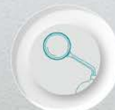
Chrome Finish Mirrors