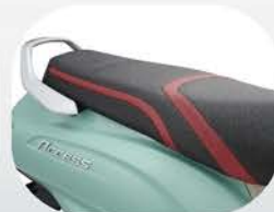
Seat Cover Maroon