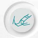
Highly Rigid Frame