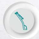
Side Stand Interlock