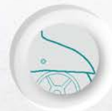
Steel Front Fender & Leg Shield