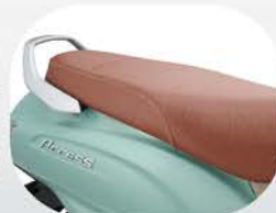
Seat Cover Brown