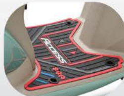
Floor Mat Black