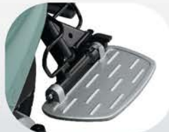
Rear Foot Rest