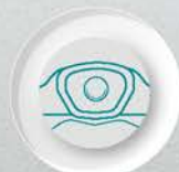
LED Head Lamp