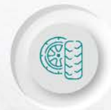
Low-Rolling Resistance Rear Tyre