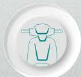
Iconic U-Shaped Design