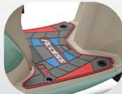
Floor Mat Red