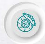
Front Disc Brake