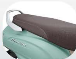
Seat Cover Dark Brown