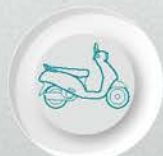
Classic Urban Styling